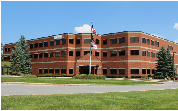
Environmental Technology Facility (ETF) 128 Industrial Park Road