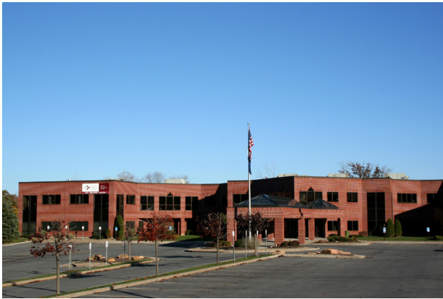
Systems Technology Facility (STF) 100 CTC Drive